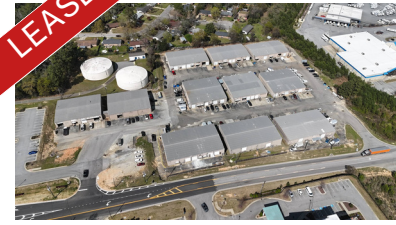
476 FLOWING WELLS INDUSTRIAL