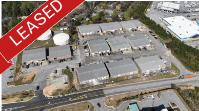
472 FLOWING WELLS INDUSTRIAL