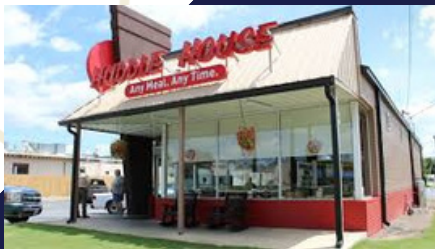
HUDDLE HOUSE - WAYNESBORO INVESTMENT