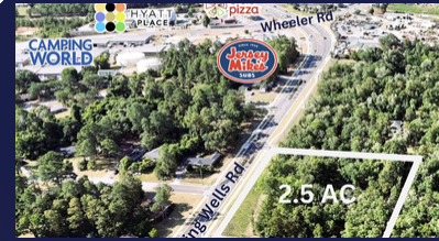
FLOWING WELLS DEVELOPMENT FOR SALE