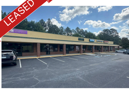
E MARION AVE RETAIL