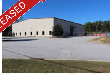
3831 WRIGHTSBORO FLEX