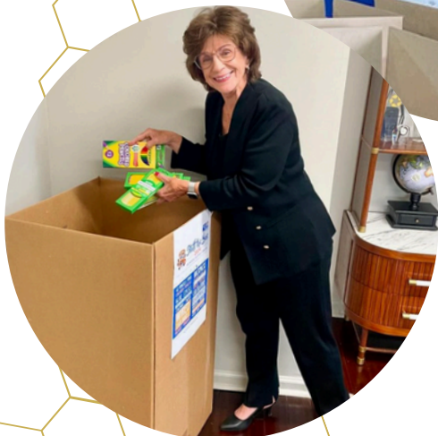
United Way of CSRA Stuff the Bus Campaign 2024