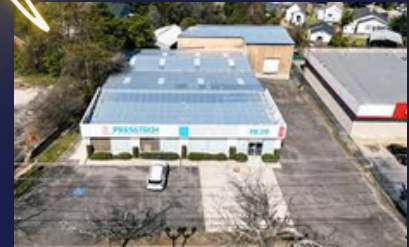
1939 WALTON WAY OFFICE/RETAIL FOR LEASE