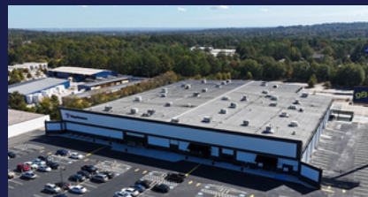
WYLDs RD. RETAIL FOR LEASE