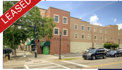
1005 BROAD ST. OFFICE